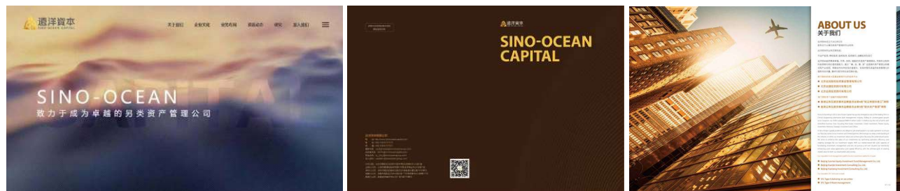
远洋资本官方网站及宣传册 / Official website and brochure of Sino-Ocean Capital

Public information campaigns provide an important way for companies to communicate with their stakeholders. Sino-Ocean Capital attaches high importance to the establishment of a positive brand image. We welcome media's supervision, and conduct in-depth cooperation with many influential financial media outlets. At the same time, actively monitor the public opinions, actively manage the self-owned new media platforms, and disclose our business developments and duty performance practices in a proactive, timely manner. To fully utilize the width, speed and interactivity brought about by the new media platforms, we make full use of innovative communication methods and channels, and guide public opinion towards the right track, thus creating and burnishing our image as a responsible corporate citizen.