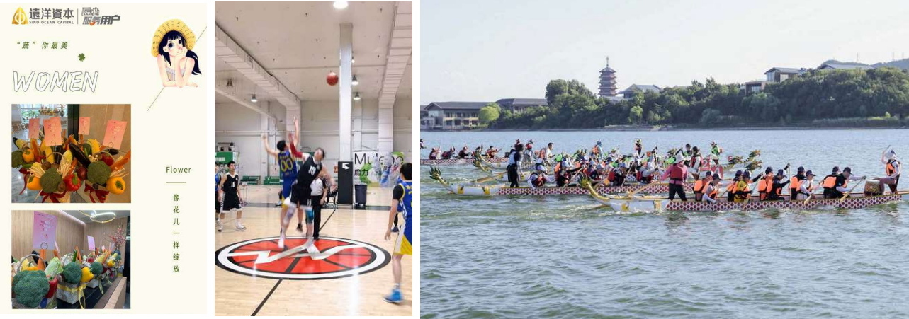
丰富多彩的特色员工活动 / Rich staff activities in various forms

In Sino-Ocean Capital, innovative and characteristic activities are carried out to highlight the inheritance of corporate culture. Employee activities include social welfare activities such as Tree Planting and Long-distance Running for Public Welfare, competitions like dragon boat racing, mountain-climbing competition and sports meeting for fun as well as other special activities such as the Company's Day, Goddess Day, Children's Day and DIY, which enrich the employee's quarterly and monthly activity calendar. Moreover, a healthy and diverse employee activity system has been built with the development of interest activities such as basketball, football, badminton, table tennis and tennis, highlighting the inheritance and renovation of corporate culture, stimulating the team's sense of competition, creating a cultural atmosphere of solidarity and working hard, and enhancing the cohesion and loyalty of the whole staff.