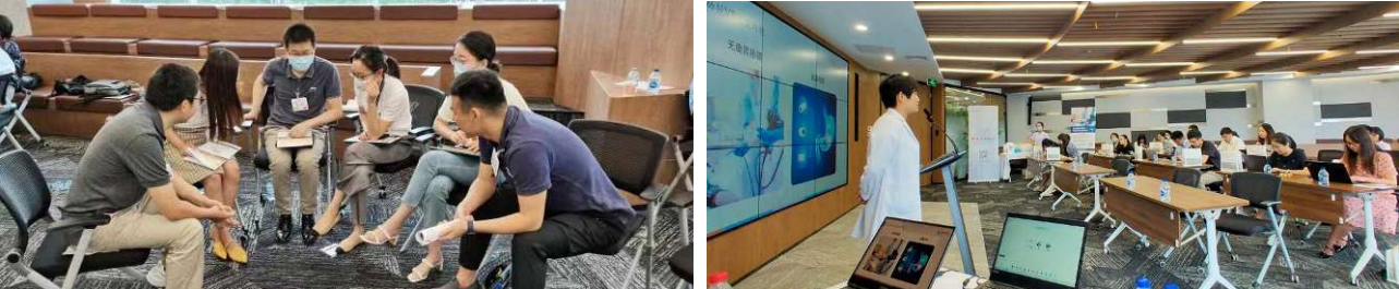
形式多样的员工培训活动 / Employee training activities of various forms

We base our employee learning and development work on a “721” personnel training mode, so as to provide business lines and functional departments with the staff members well-trained and full of initiative. “Responsible person” at all levels are deemed as the first persons responsible for employee training. Responsible person provide guidance and feedback to employees based on the routine work. With talent development tools, they also formulate and implement learning and training plans to promote employee development. By attending various training activities organized by Sino-Ocean Capital, employees are expected to fully understand, recognize and practice our values and corporate culture, thereby generating a sense of belonging from the bottom of their heart. Besides, employees have the chance to personally experience the performance-oriented corporate culture, develop a professional awareness, required skills, and teamwork spirit, and get familiar with our strategy and management style. Inspired by successful managers, they will take Sino-Ocean Capital’s vision as their own ambition, and seek to grow stronger and faster on the platform we provided.