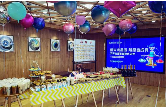
员工生日会及项目庆功会 / A glance of our birthday party and victory party

Sino-Ocean Capital cares for employees' life and meets their needs in all aspects. We provide meals, tea and drinks for employees all year round, share health-care knowledge regarding 24 solar terms, and build a diversified employee welfare system. Medical consulting room, TCM physiotherapy and gym are set in the workplace. Birthday parties, orientation parties, celebrations and visits expressing condolences convey our concern and care for our employees and enhance their sense of belonging.