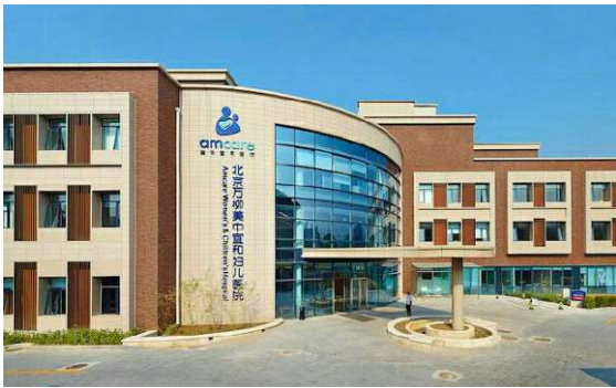
美中宜和妇儿医院院区 / Amcare Women's and Children's Specialized Health Hospital

Sino-Ocean Capital participates in the management of invested companies appropriately, by assisting them in strategic planning, standardizing their internal control systems, and getting involved in their formulation of employee appraisal and incentive schemes. While enabling the invested companies to operate more meticulously, we work with them together to explore new engines for business growth.