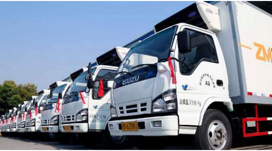
郑明现代物流车队 / ZM Logistics fleet

Sino-Ocean Capital endeavors relentlessly to achieve greater synergies, and brings investment projects under refined management with the help of ESG indicators. Through internal and external collaboration, we assist the funded entities in obtaining such resources as data traffic, products, and policies, and actively create more value to achieve a win-win situation.